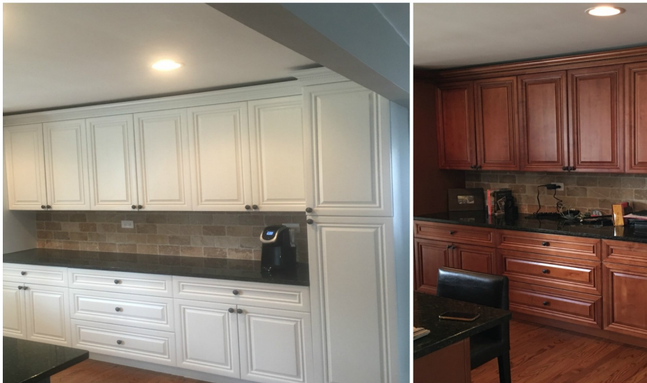
Clean finish with Milkshake White